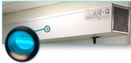
Air-Q UVC output Measurement